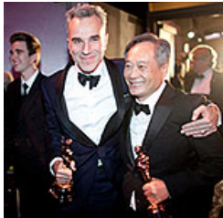
Oscar-Winning Lessons in History and Hard Sell