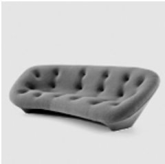
Analyzing the Couch