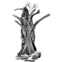
Op-Ed: A Vatican Spring?