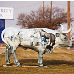
Beef Plant Closing Takes Toll on Texas Town